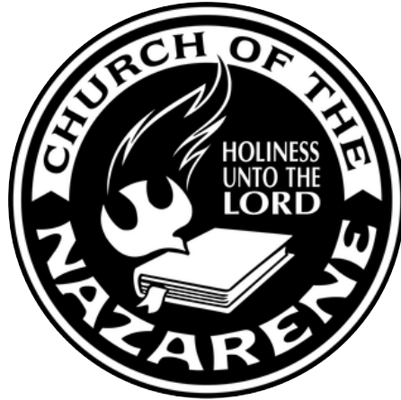
Brawley Church of the Nazarene